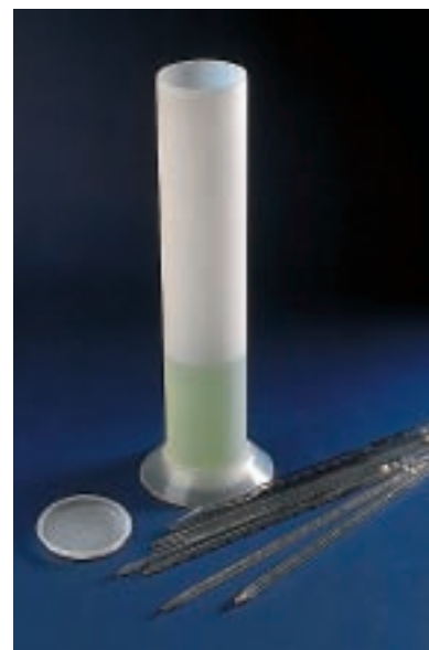
Pipette jar, polypropylene