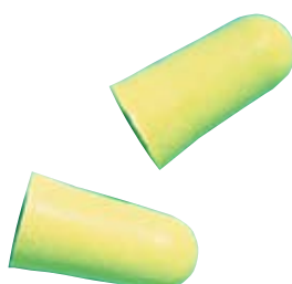
Ear plugs, Pura-Fit