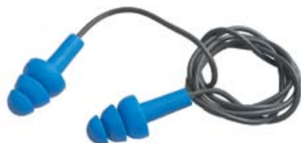
Ear plugs, E.A.R. Tracers, BS EN 352-2 : 2