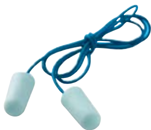
Ear plugs, soft blue detectable, E.A.R. BS EN 352-2 : 2