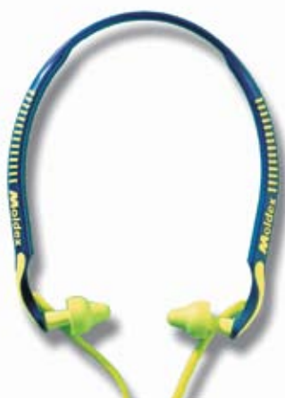
Ear plug, Jazz-Band®